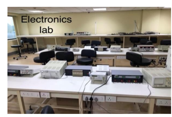
Figure: Software and Hardware laboratory