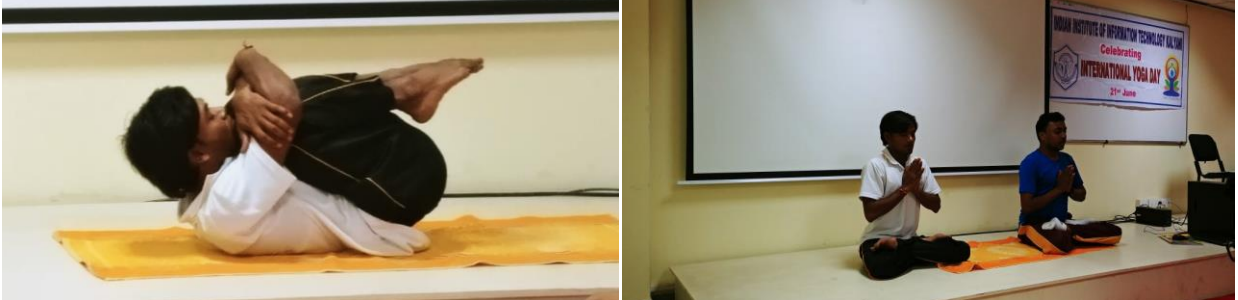
International Yoga Day Celebrations