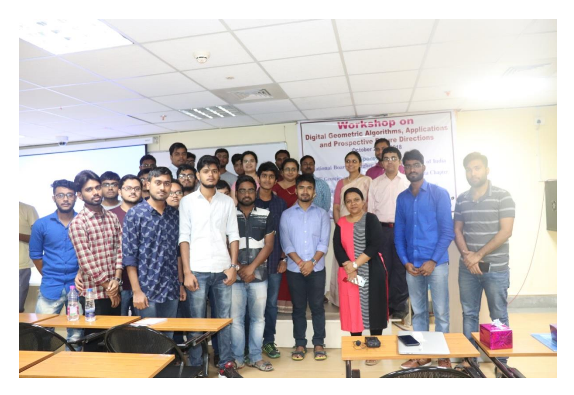
Figure: Workshop on Digital Geometric Algorithms