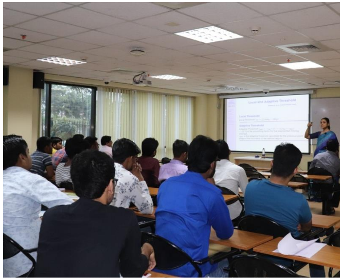
Figures: Workshop on Digital Geometric Algorithms