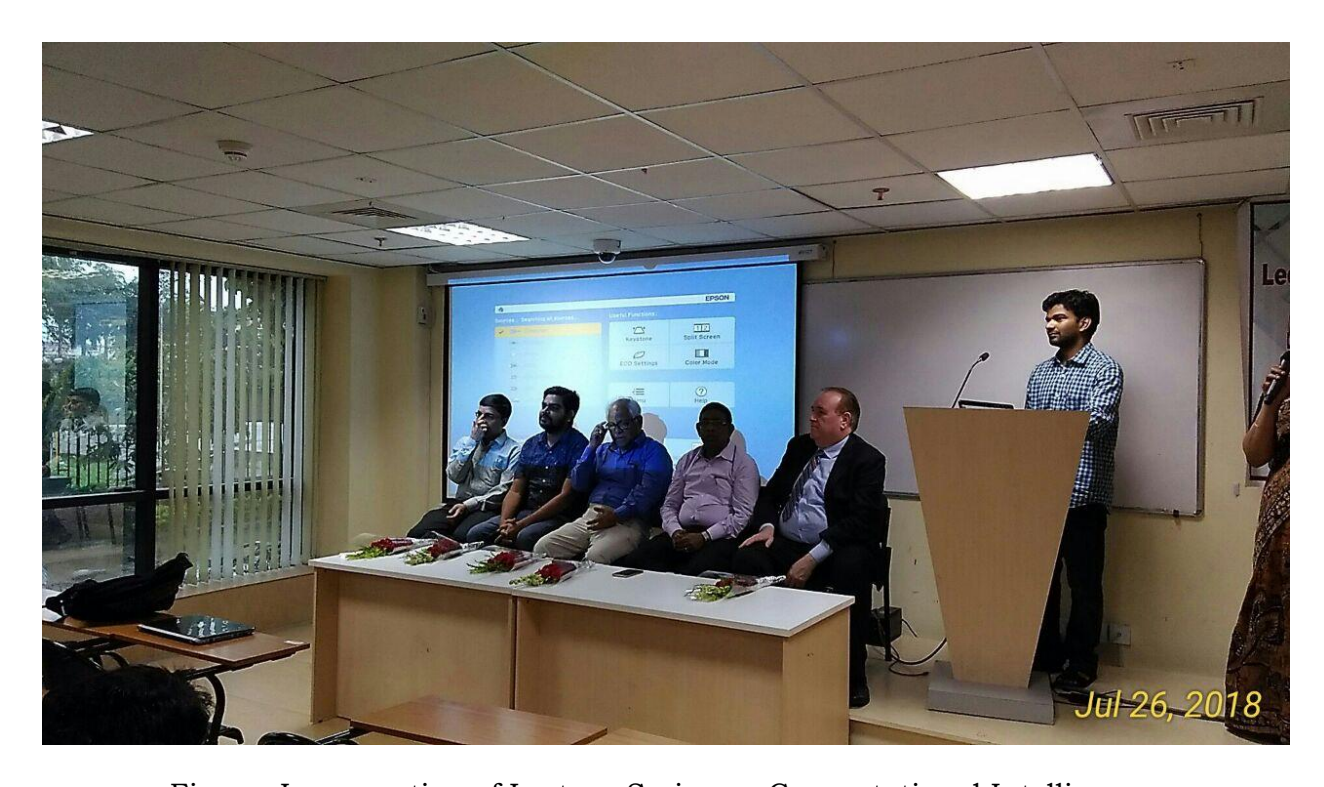
Figure: Inaugaration of Lecture Series on Computational Intelligence