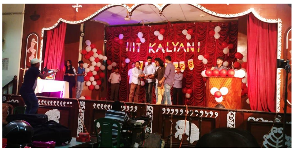
Figure: Teacher's Day Celebrations