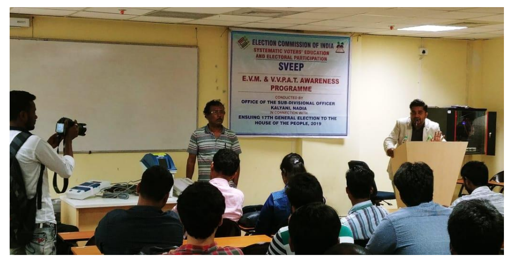
Figure: Awareness program on AVM and VVPAT